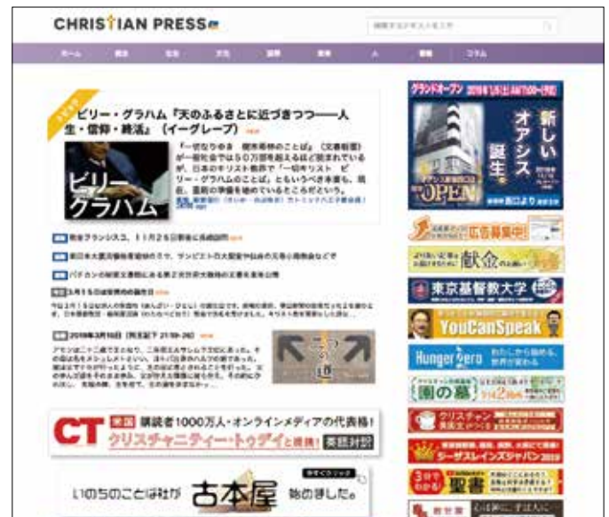
News site launched by JBS Christian Press