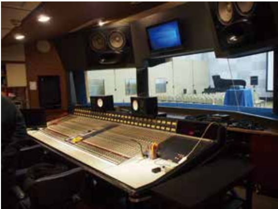
A recording studio at AVACO