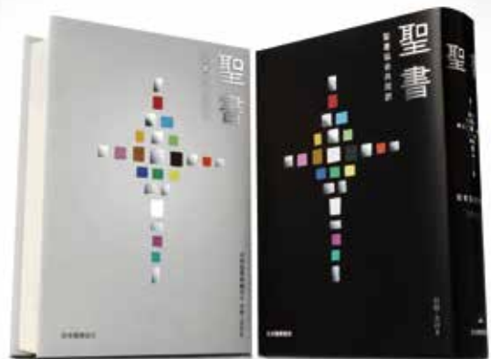
Newly translated Bible