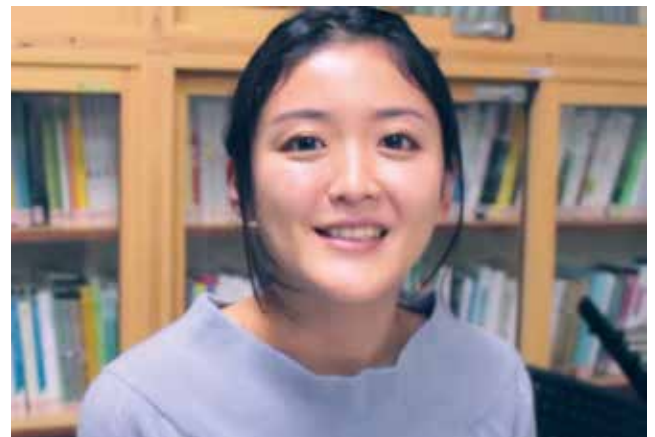
Best Award: "I've asked Christians"

V ideo Clip Competition Award is a project which invites participants to submit original video films based on Biblical words or contents. In this competition, we received 48 entries from April to July 2018. Four judges evaluated each film and selected 20 films as prize winners. This award offered two categories; 1) 1-minute video clip for CM category and 2) 3-minute video clip for short film category. Awarding ceremony was held at United Cinemas Toyosu, Tokyo.