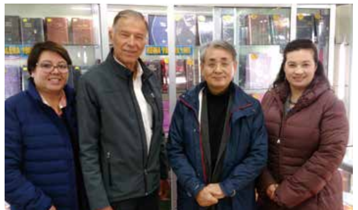
With Bolivian Bible Society staff