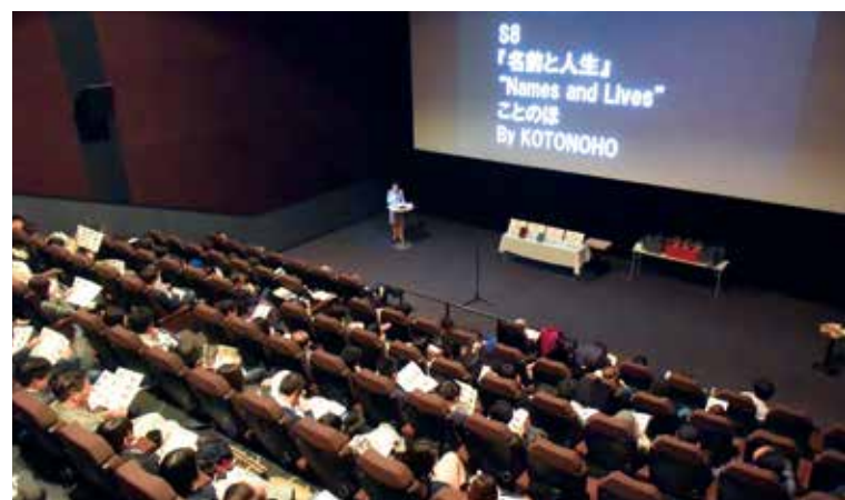
United Cinemas Toyosu was the venue for the award ceremony

V ideo Clip Competition Award is a project which invites participants to submit original video films based on Biblical words or contents. In this competition, we received 48 entries from April to July 2018. Four judges evaluated each film and selected 20 films as prize winners. This award offered two categories; 1) 1-minute video clip for CM category and 2) 3-minute video clip for short film category. Awarding ceremony was held at United Cinemas Toyosu, Tokyo.