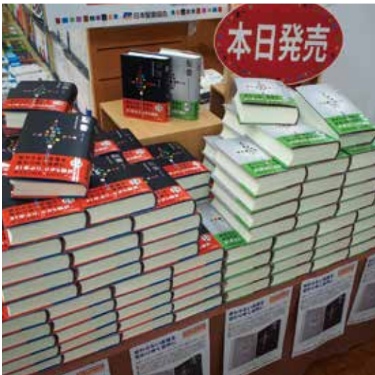
“Bible, Japan Bible Society Interconfessional Version” unveiled!

short period because of paratext, a translation support software, which helped translate the text efficiently. The dedication and the efforts of those involved in the project were indispensable.