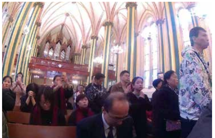
People praying in the church