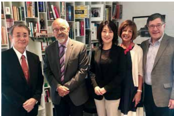
An agreement was signed with Christianity Today, US.

scint-of-Christ to people and hope to cast light on this era of uncertainty. Taking advantage of the worldwide platform, we would like to deliver the good news, good messages rapidly at low cost to not only Christians but also to non-Christians.