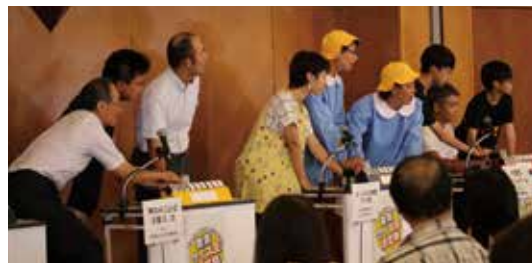
Participants responding to the questions