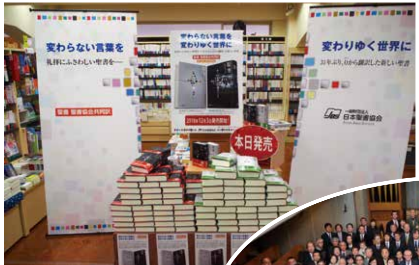
Group photo after the dedication ceremony