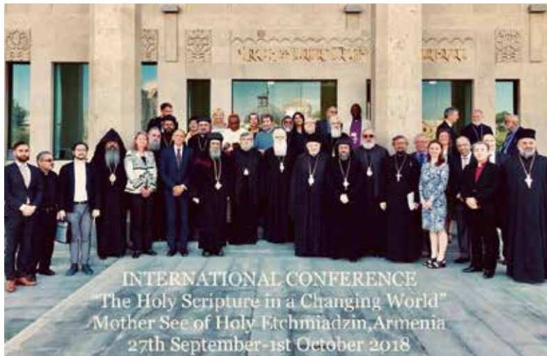
Eastern Orthodox Church, Oriental Orthodox Church, Catholic Church, and UBS joint meeting

In the joint statement, they announced the building of stronger cooperative structures in the areas of Bible translation and distribution. The 20 participants were from the neighbouring countries including Russia, Kazakhstan, and Slovakia.