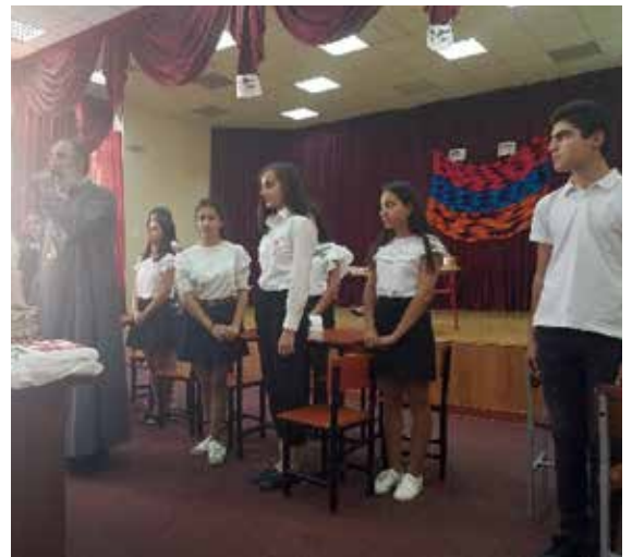
Bible competition for middle school students