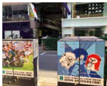
Ad for the 2019 Rugby World Cup seen in Ginza