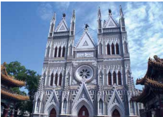
Church of the Savior, Beijing

Church in China and Deputy General Secretary of Chinese Patriotic Catholic Association, explained the current situation of Chinese Patriotic Catholic Association and Chinazation of Christianity. He emphasized that churches in China have focused on the massive change after Chinese economic reform and have been contributing to social welfare and education.