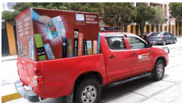
Bible delivery truck