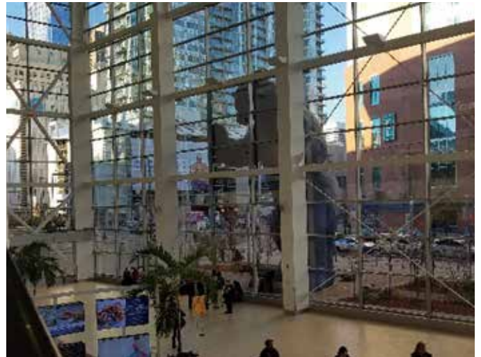
Colorado Convention Center in Denver