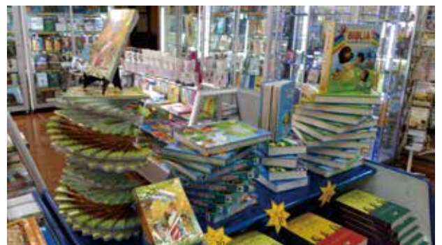
Bolivian Bible Society bookstore