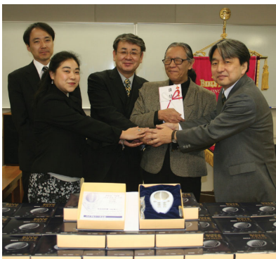
Presenting the Bible Talk to the MODEN