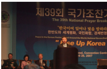
The 39th National Prayer Breakfast