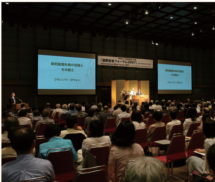
A view of the Lecture Hall

International Bible Forum 2007 was held on 27th and 28th of June at Tokyo International Forum. Five speakers from abroad (photos below) each gave a lecture and some four hundred people attended each lecture. "Canon and Apocrypha" was one of the themes of the forum, and recent discoveries, not only the Gospel of Judas but also very rare stories of the apostles, were explained to the general audience. The Forum had other topics such as women in the Israelite society and contemporary reading of the book of Isaiah. Although the Forum 2007 was much smaller in scale than the Forum 2006, its topics were more focused and the audience showed keen interests in each lecture (total attendance : ca. 2,000).