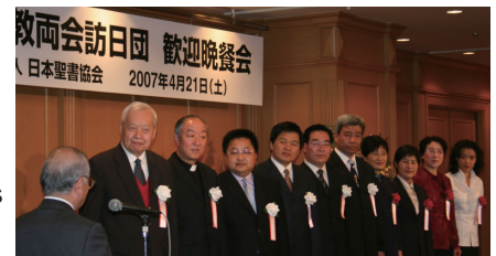
CCC and TSPM members at JBS reception