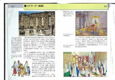
Many pictures and diagrams

The Bible Plus is a Bible specially designed for students in junior high and high schools where Bible is taught as part of the curriculum. With the cooperation of Italian Bible Society, it provides abundant information such as historical backgrounds, arts and architectures depicted in the Bible. The Bible Plus, with its colorful reference, is highly convincing in teaching the Bible.