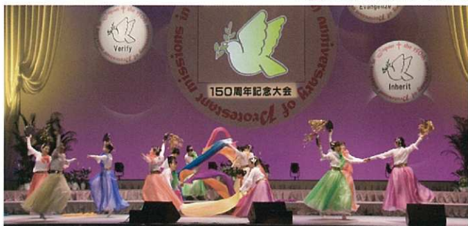
Performance at the Festival

At the Festival on the 1 st day, we praised the Lord with dance, performances, drama, etc. An encouraging video message from Pastor Rick Warren, Saddleback Church in U.S.A., was shown as well. Pastor Rick Warren is famous for his book "Purpose Driven Life" and he is also known as the Pastor who prayed at the inauguration of the President of the U.S.A., Barack Obama. His book was translated into Japanese and it influenced many Japanese Christians. He served in Nagasaki as an intern long time ago.