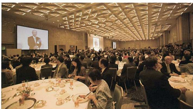
Reception of 900 people