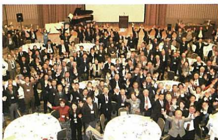
National Prayer Dinner Meeting

"Praise God in heaven! Peace on earth to everyone who pleases God."