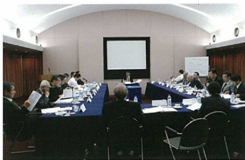
Discussion for "Translation Policy"

Next year, JBS will start working on the "Translation Policy" and we estimate that the translation will take approximately 6 years to complete.