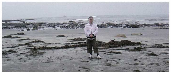
At Cape Alava near Seattle

Over 170 years ago, 3 sailors from Japan reached the shore of Cape Alava, near Seattle Washington, USA. The sailors were delivering rice to Tokyo, then known as Edo, when a vicious storm destroyed their ship. They drifted across the Pacific Ocean for 14 months. Upon making landfall on Cape Alava, they were captured by the Makah people then rescued by a British merchant. Otokichi and his friends then traveled to Hawaii, London, and Singapore, finally arriving in Macao where they met a Prussian (German) missionary, Karl Gutzlaff. Gutzlaff asked them to help translate the Bible into Japanese. With the sailors help, the Gospel of John and the Letter of John were completed and published by ABS in Singapore in 1837. These 3 sailors were the first to travel around the world, and the first Japanese to visit the USA, England, and Singapore. Otokichi married an English woman and became the first Japanese to acquire British nationality.