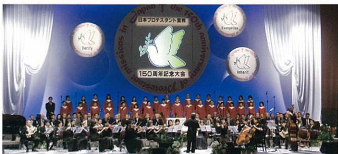
Orchestra &amp; Choir