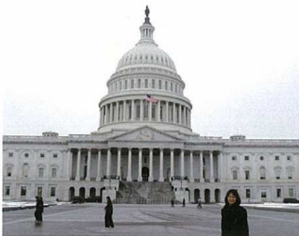
The U.S. Capitol Building

Both President Obama and Clinton, with deep understanding of faith, gave a speech worthy of a world leader.