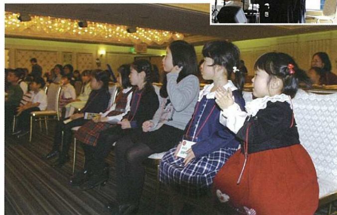
Over 30 children attended