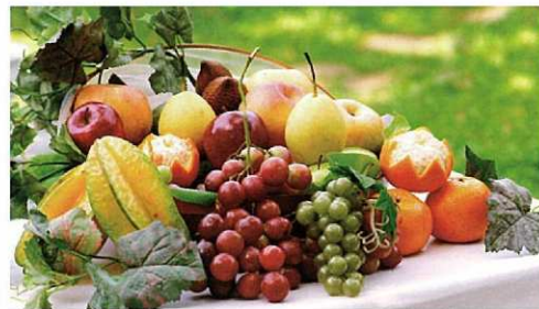
Sample page Galatians 5:22-23

The Bible Photo Collection is scheduled to be published in autumn 2010. The book comprises of photos collected by pro and amateur photographers from all over Japan. The photos will accompany Biblical verses of the photographer's choice. It will be a prime example of the way Japan Bible Society strives to deliver the Word of God to the present generation in a real and dynamic way.