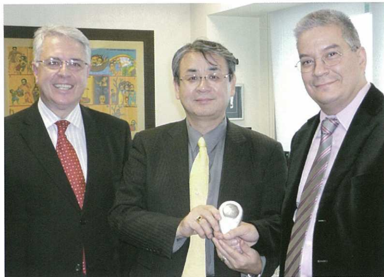
With the Board Chair of BS of Spain and Director of Nueva Luz