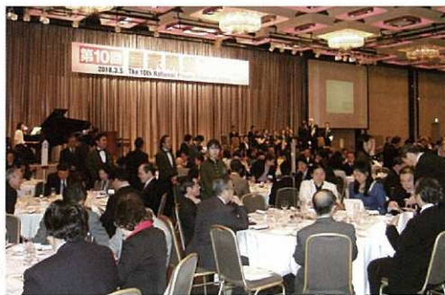
Over 500 people attended