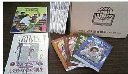
The Donation Package

In October 2009, Japan Bible Society donated various Children's Bibles to 120 Christian Foster Homes for children in Japan. The recently published 17 products that target the young generation were delivered to each home. Many thank you letters were received to date. We pray that these Bibles will help the children who are separated by their families for various reasons to get to know the love of God and to be able to live in hope even in times of difficulty.