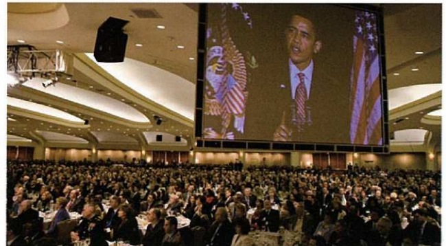
Over 4,000 people attended