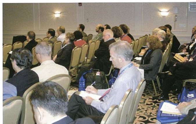
Seminar Attendants listen fervently