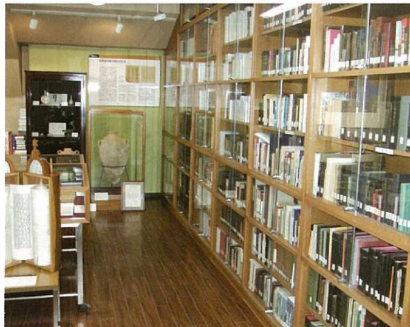
A variety of Biblical study materials are stored in the Bible Library