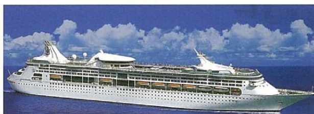
80,000-ton cruise ship - the Royal Caribbean “Vision of the Seas”