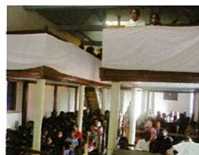
Church service in Madagascar

From Aug. 7 to 10, the two visited the Haitian Bible Society to offer the donation collected from our donors in appeal to the earthquake in January. The scar of the earthquake was left freshly as it was with many collapsed buildings still remaining untouched in Port au Prince. The hardships and devastation are still very much a reality, but the Haitian BS was encouraged by the support from friends of the United Bible Societies. It was inspiring to see the mission eagerly carried out to deliver the Bible to people who had lost their property as well as hope.