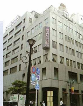
Bible House in Ginza

The Bible House where JBS has its office is located in Ginza, in central Tokyo. It was designed by a Czech born American architect Antonin Raymond and was constructed in 1933. The Bible House survived from the damage of World War II, and it is one of Ginza's cultural heritages. Though it went under some renovations over the years, the Art Deco carvings on the walls and the marble-stone hall are still preserved from the time it was built.