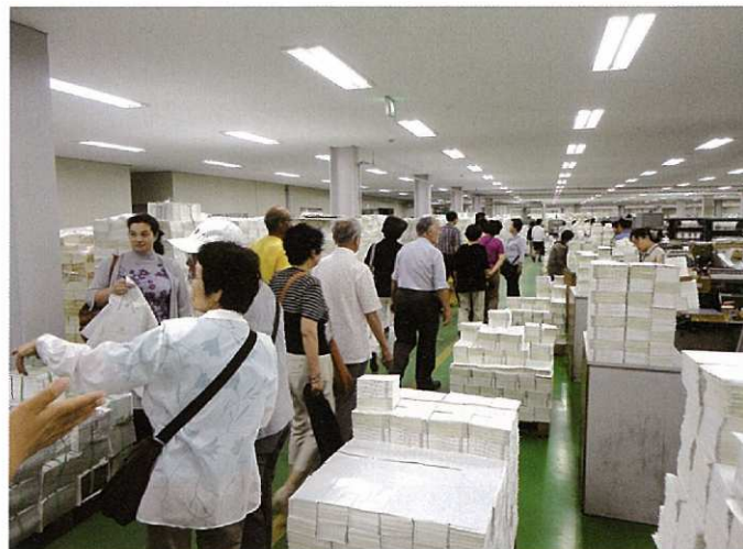
Delegation visiting the bindery, Bible Korea