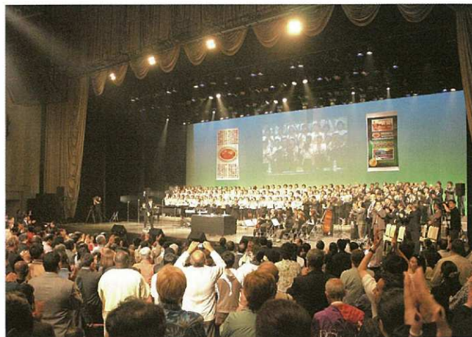
Global Mission Consultation Edinburgh 1910 to Tokyo 2010

Edinburgh 2010 Global Mission Consultation was held from May 11 to 14 in Nakano, Tokyo in commemoration of the centenary of the first "World Missionary Conference" held in Edinburgh in 1910. To look back on the history of faith and mission of the past 100 years, and to rethink the future of Christianity on a global scale, 900 missionaries from major denominations gathered from 140 countries. JBS set up a booth to showcase our products and to supply the attendees with information and resources available to help their ministry.