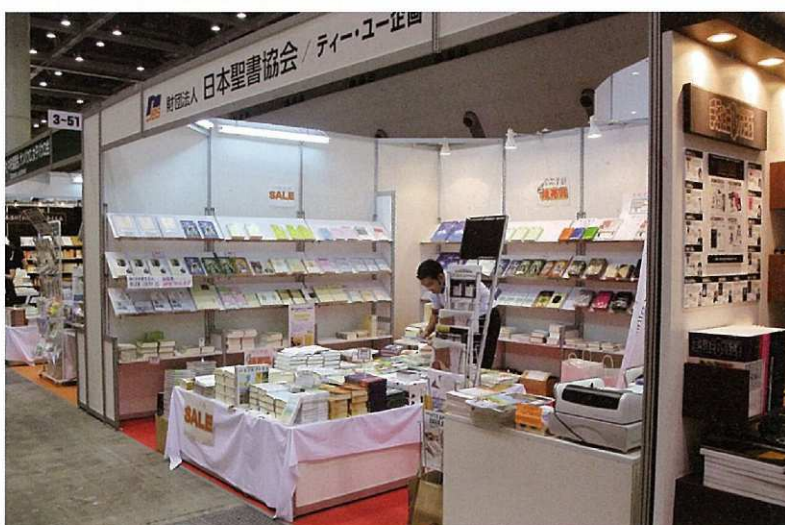
JBS booth at the Tokyo International Book Fair

The 17 th Tokyo International Book Fair was held from July 8 to 11 at Tokyo Big Sight, Japan's largest exhibition-oriented convention center. Continuing from last year, JBS set up a booth to demonstrate our products. About 1,000 companies from 30 countries exhibited, and 87,000 people in total visited the Book Fair which lasted for four days. There were many non-Christian visitors to the JBS booth, and not only the Bible itself but other creative products such as the Art Bible, Children's Picture Bible and the Manga Bible were their high interests.