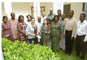
With staff of the BS of Togo