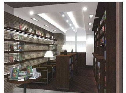
Newly opened Bible House Minami Aoyama