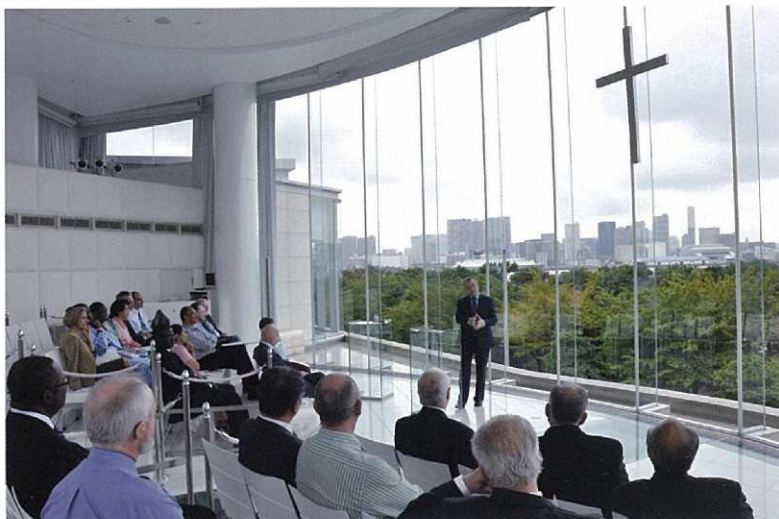
Devotion on the first day