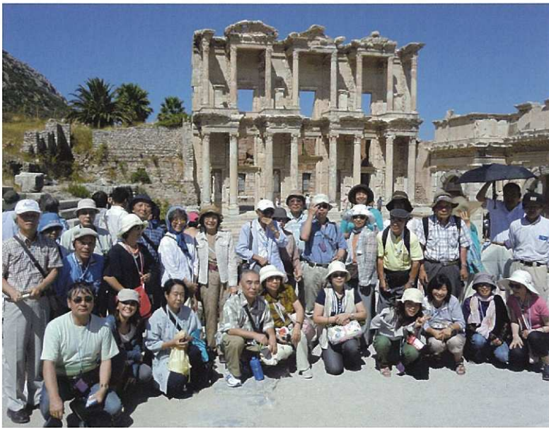
The Library of Celsus, Ephesus