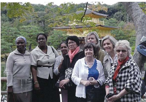
In front of the Golden Pavilion in Kyoto