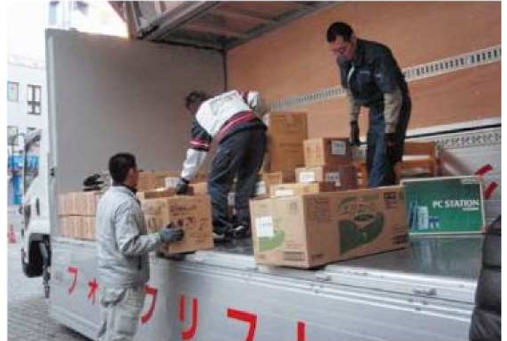
7-ton truck was hired to take Bibles and relief goods