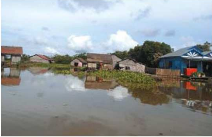
Floating village in Tonlé Sap