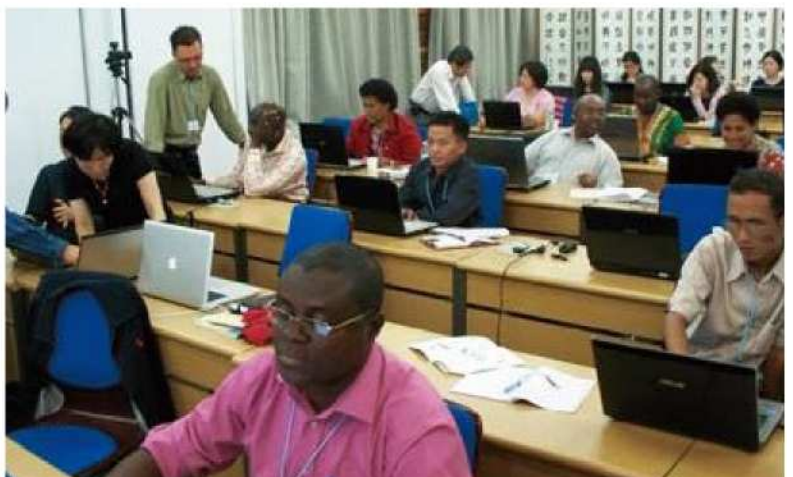
Attendees tackling with Publishing Assistant