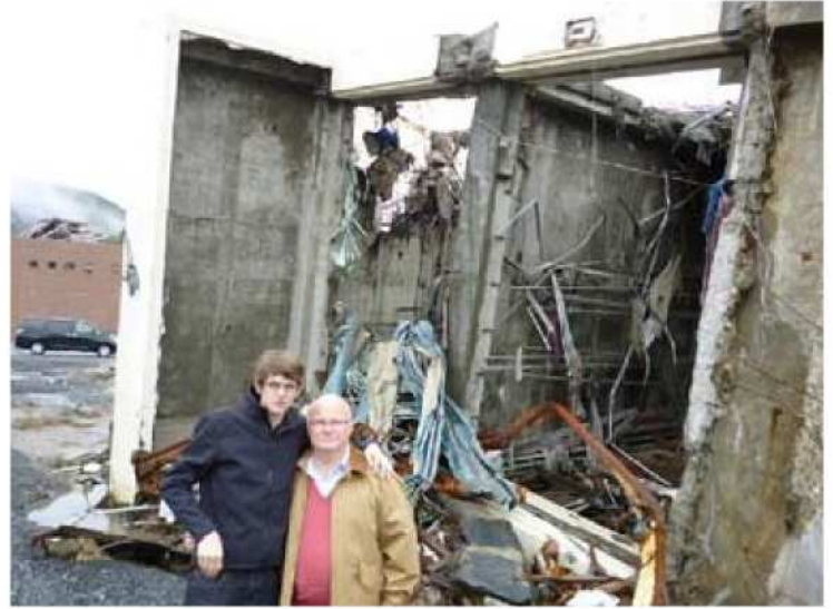
In front of a fire department destroyed by tsunami