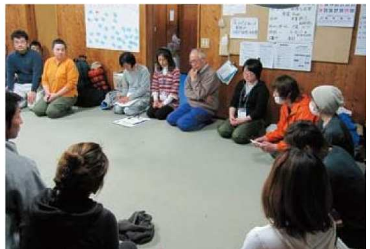
Volunteers' prayer meeting