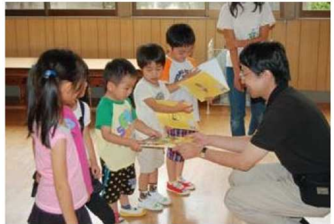
At Onahama St. Timothy's Church Kindergarten

Further distribution effort was made to the tsunami-affected areas where we were unable to visit in person. Bible packages (including a full Bible, 36-volume picture-book Bible, and Manga Bible) were sent to 72 churches, 66 kindergartens and nursery schools. The picture-book Bible and the Manga Bible were given to children to ease the trauma. We pray that through the Gospel message, they will be touched by the love of God, and find peace in this time of difficulty.