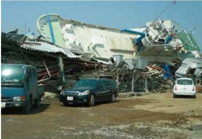
Ship washed ashore by tsunami

JBS started relief activity immediately after 3.11 earthquake, by running a fundraising campaign to collect 20 million yen to distribute 20,000 copies of the Bible in the affected areas. Up to now, the total amount of 259,305USD was raised (193,305USD from 23 Bible Societies and churches overseas; 66,000USD from donors in Japan). As a result, 50 churches and Christian-related institutions in the disaster-hit Tohoku region of northeast Japan (Miyagi, Iwate and Fukushima prefectures) received the Bible and relief goods and through them, many received the hope which can only be found in Jesus Christ. We thank you all for your generous support, encouragements and prayers.