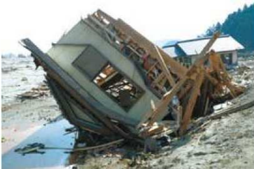
A house turned over by tsunami

JBS became a self-supporting Bible Society in 1968, and this was the first time since then that we received warm financial support from the UBS family. We are once again reminded that this support is entirely rooted in Christ's love and the bond among the Bible Societies could only come from such fellowship.