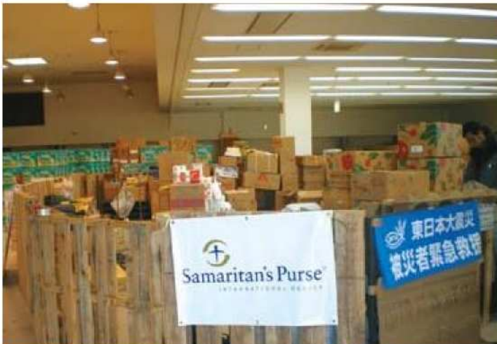
Relief goods came from all over the world