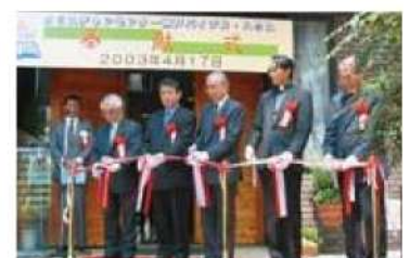
Opening ceremony of KBH

When the Great Hanshin-Awaji Earthquake hit Kobe in January 1995, JBS collaborated with the local churches to organize a Bible Exhibition which resulted in the establishment of “Christian Center Kobe Bible House.” Ever since, KBH plays a vital role in connecting local churches and promoting Bible Work in the area. JBS will continue to support Tohoku and work toward the establishment of a similar Christian Center that will be a lighthouse to spread the Good News of God's unending love and mercy. Please continue to pray for our dear brothers and sisters in the Tohoku area. God bless you.