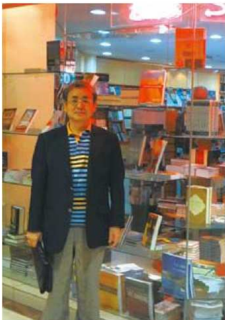
At the bookshop in Dubai