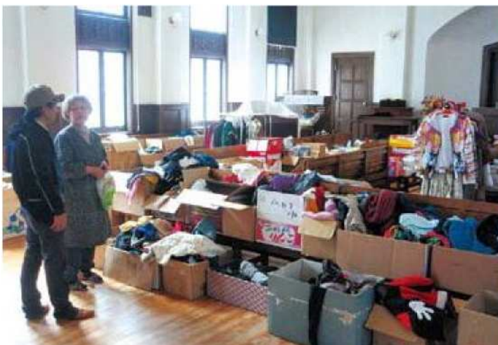
Churches became supply centers