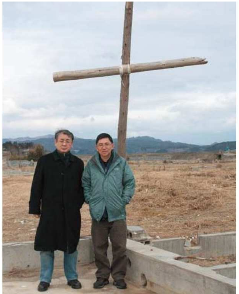
A former church site and the cross built with debris