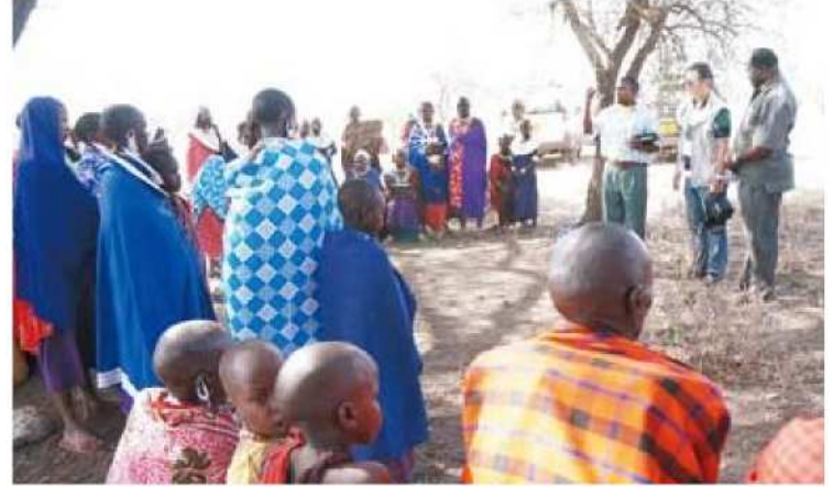
Worship with the Maasai