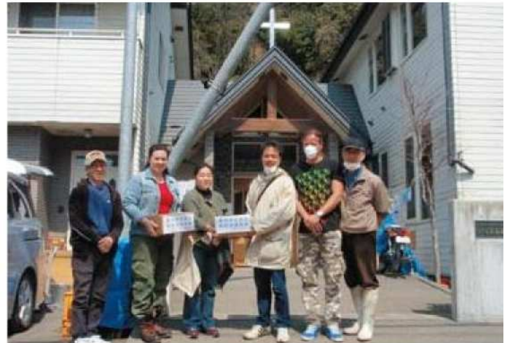
Donating the Bible to Shinsei-Kamaishi Church