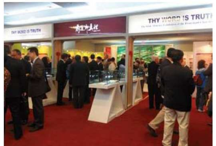
Over 300 guests attended the opening