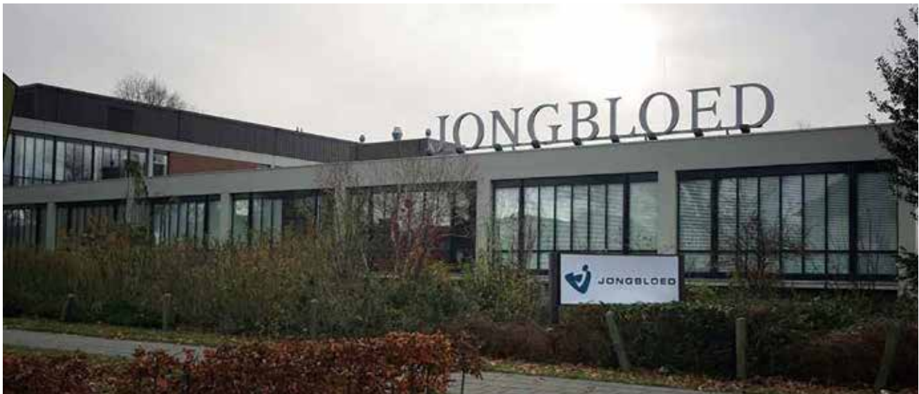
Headquarters located in Heerenveen, Netherlands