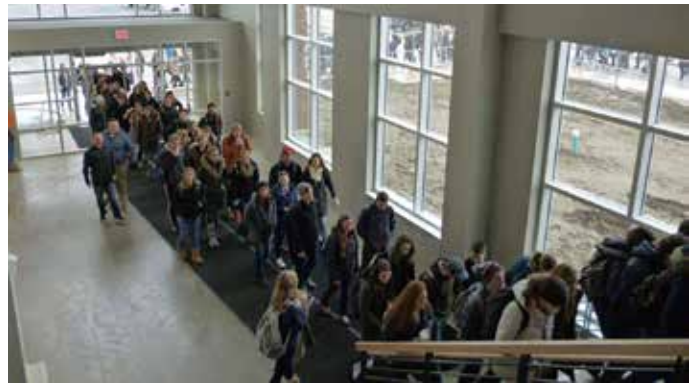
Students heading to worship

offering them an opportunity to experience Christianity in the US. It also aims to support people in the disaster area in 2016.