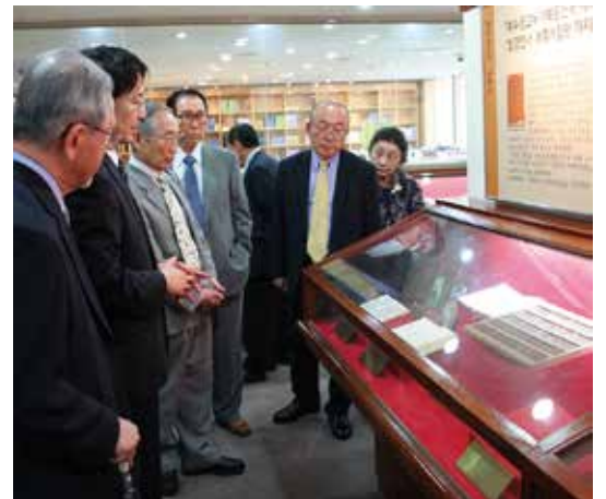
Seeing the display at KBS