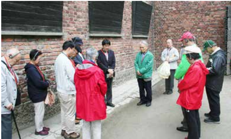
Praying together at Auschwitz Concentration Camp

also visited Auschwitz Concentration Camp, and the Berlin Wall. They confirmed the importance of putting their trust in the Bible and to hope for peace through everyday learning.