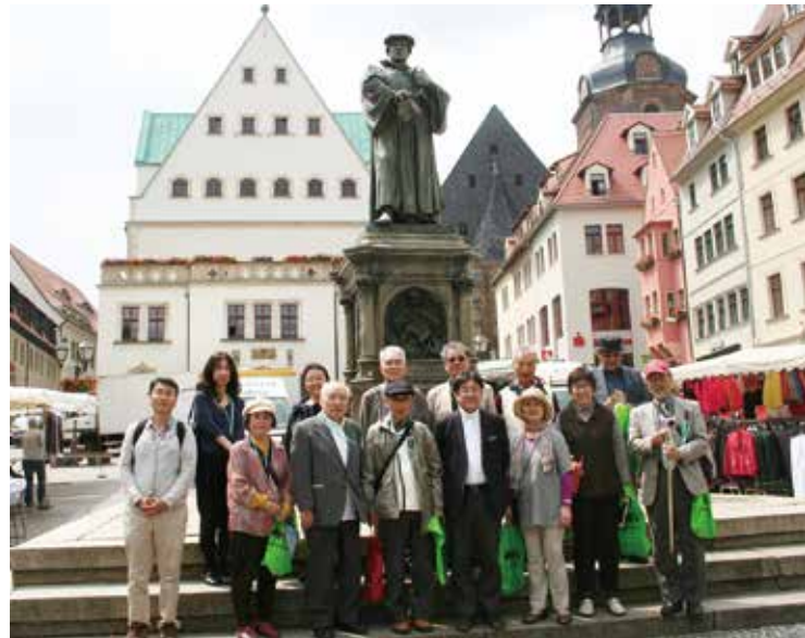
In front of the statue of Luther at Lutherstadt Eisleben, Germany