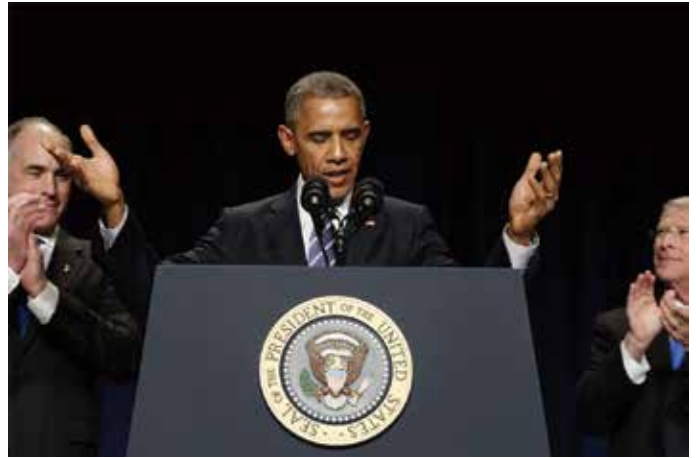
President Obama giving the address

members of the United States Congress, including a dozen participants from Japan.