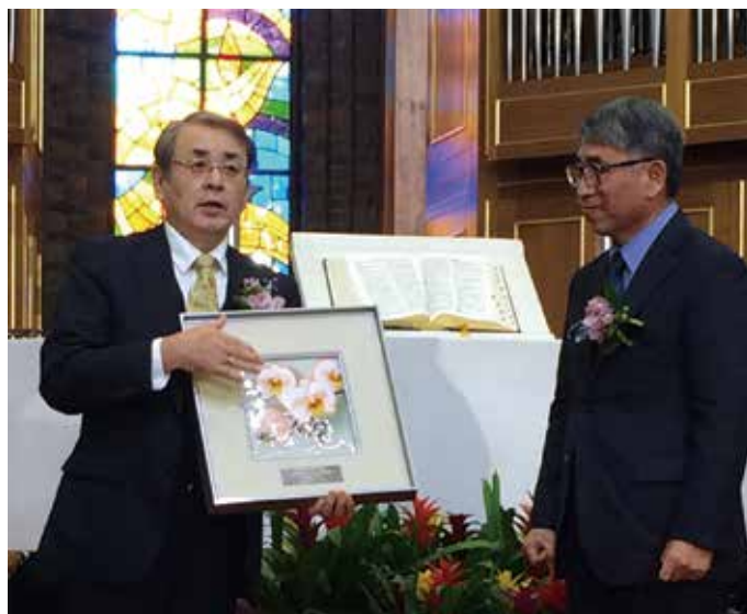
Shippoyaki (cloisonné) art was gifted to KBS