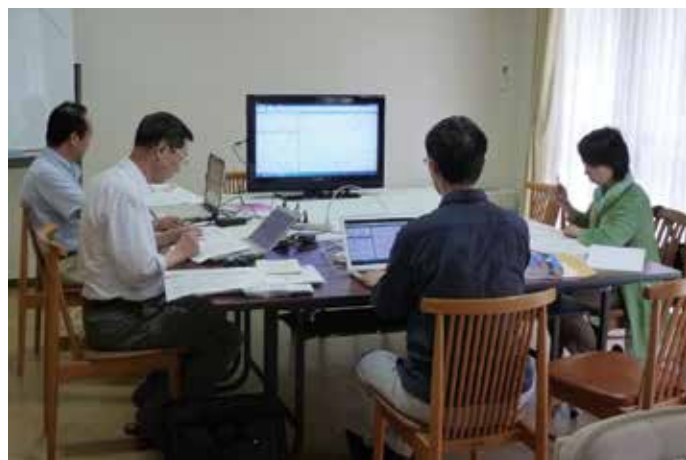
Translation committee's meeting for Pentateuch and Historical books

More than 150 people, including 60 translators are engaged in the work. Under the cooperation of the Greek/Hebrew language team and the Japanese language team, we aim at translating into refined beautiful Japanese. Since December 2015, books that we finished translating are published as pilot editions to call for monitors to give feedbacks.