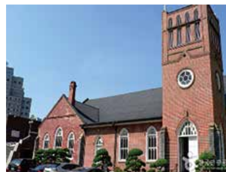
Chungdong First Methodist Church