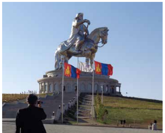
Gigantic statue of Genghis Khan in Ulaanbaatar