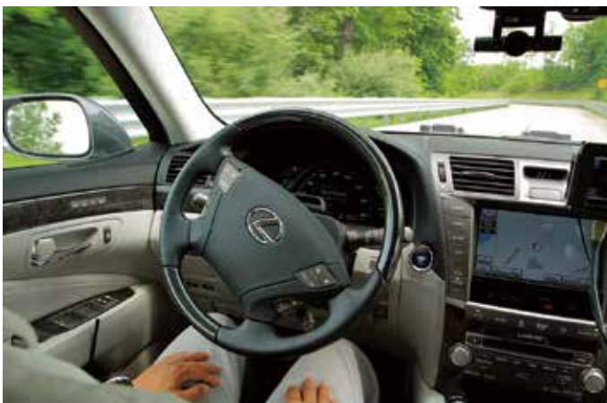
Automatic driving test on the public road

Japanese car manufacturers are experimenting the automatic driving system on public roads. Toyota performed the experiment on the Metropolitan highway on October 6th. The car responds without touching the wheel to multiple operations such as curving, joining at the junction, and surpassing. At the Tokyo Motor Show on October 28th, Mr. Carlos Ghosn, President of Nissan Motor Corporation, showed a pilot model for automatic driving. Honda, Mitsubishi, Fuji Heavy Industries are also working on the technology. Coming 2017, the system will likely to be realized under limited conditions such as on highways or driving in a traffic jam.