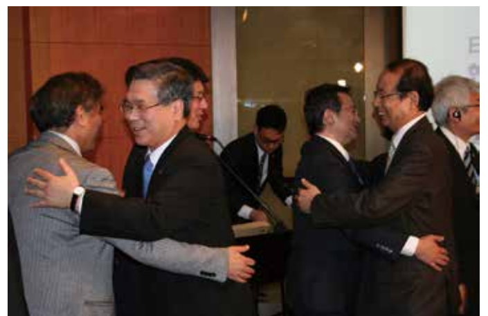
Participants hug after the conference