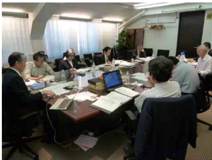
Translation committee's summer meeting

In 2015, the new translation work made a big progress. 60% of the draft is completed. 45 translation committee's meetings were held during 2015 and the drafts of many scriptures were sent to the editing committee. The main goal of the new translation is based on the Skopos theory - to be suitable for usage in the worship in church.