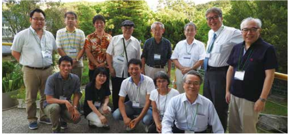
Participants from Japan

As part of the activities in East Asia related to the ongoing Lausanne/WEA Global Campaign for Creation Care and the Gospel, East Asia Conference took place in Hsinchu City, Taiwan in July 2017.