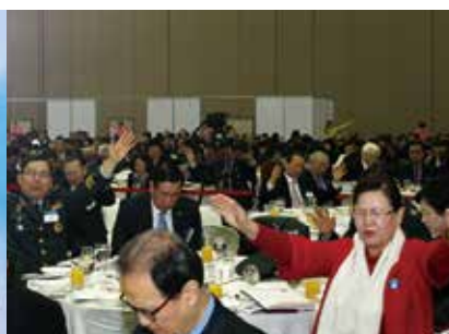
Praying for the world peace