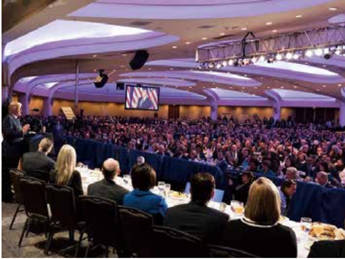
3,800 people from 140 countries filled the hall