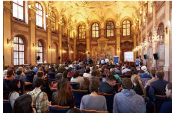
Scene from 2014, Prague

The International Bible Championship Jerusalem will be held in Prague on May 13, 2018. JBS is cooperating with this event and hopes to bring the event to Japan in the near future. Stay tuned for updates. Delegations from your Bible Societies are most welcome.