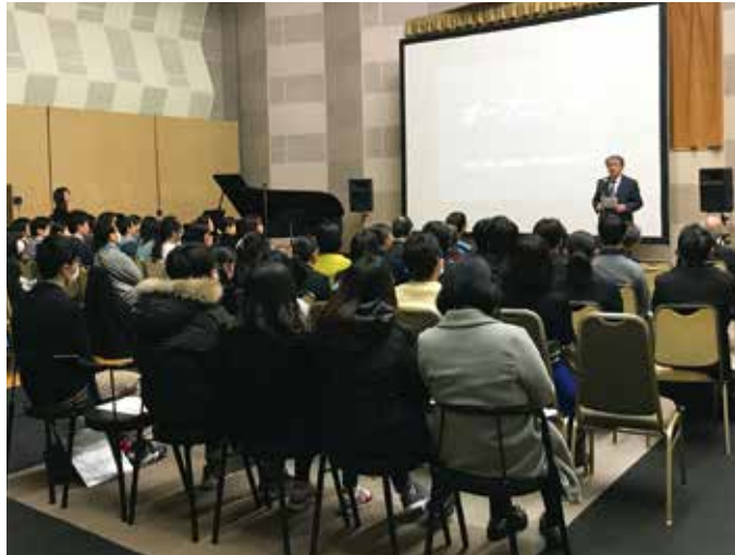
Candidates and audiences together watched nominated films