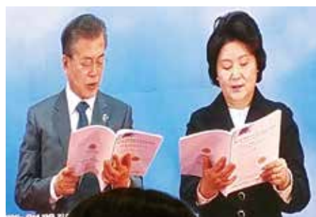
President Moon Jae-in and the first lady Kim Jung-sook

JBS has been hosting meetings every year to forward communication between Korean and Japanese church leaders.