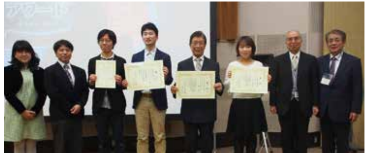
Photo session with Outstanding Performance Award winners