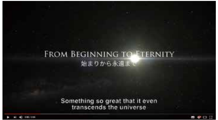
Encouragement Award, "From Beginning to Eternity"

For the 3rd Competition, we are calling for entries from March to October 2018.