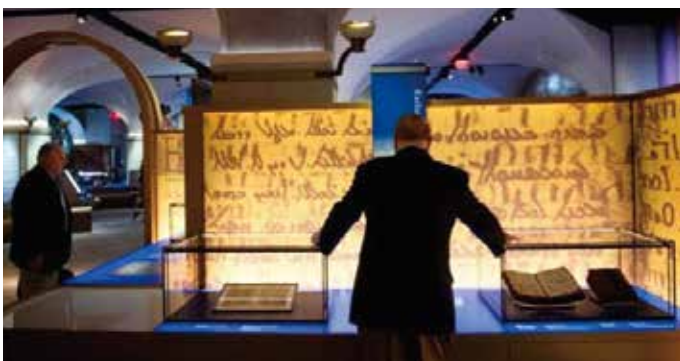
1,150 items from the museum's permanent collections are on display