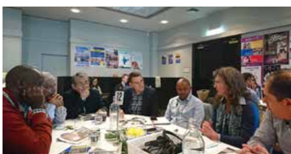
Roundtable "discussion" Exchange