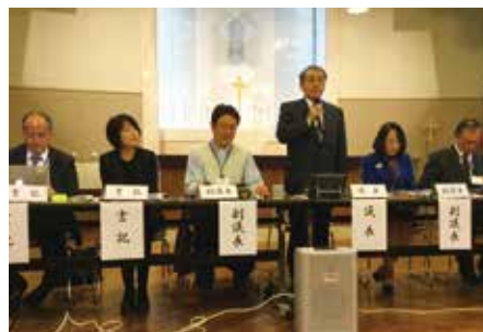
New committee members (Moderator, Vice-moderator, General Secretary, Secretary) were elected at NCC 40th General Assembly

From 2018, I will be serving as the Moderator of the National Christian Council (NCCJ) in Japan, along with my service here at JBS. It is my prayer that the name of the Lord will be praised in Japan even more with your prayers and supports.