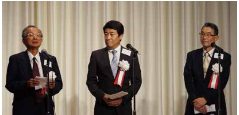
Church leaders from NCCJ, JEA and JPC