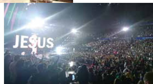
Hillsong Conference at Qudos Bank Arena, Sydney