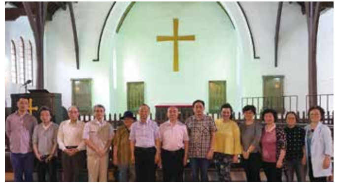
At Langzhong Church

The National Christian Council in Japan started its relationship with China Christian Council (CCC) and the Three-Self Patriotic Movement (TSPM) when the churches started reopening their doors after the Cultural Revolution. NCCJ sent its first delegation in 1983. The first delegation from China visited Japan the following year and so the reciprocal visits to renew and reaffirm friendship began.