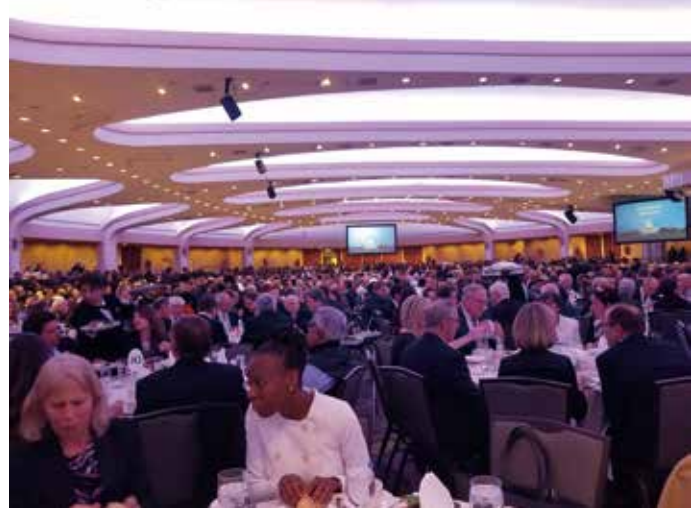
The gathering began in 1953