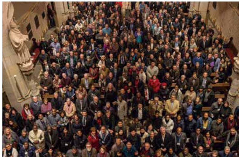
Attendees of the Wittenberg 2017 Congress in Castle Church