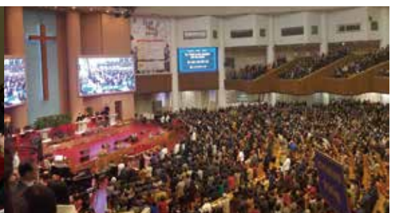
Sunday service at Yoido Full Gospel Church, Seoul