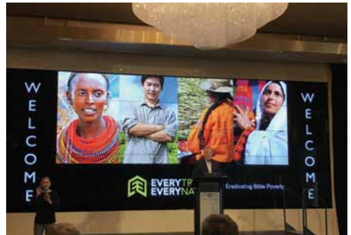
YouVersion – 10th Anniversary Celebration