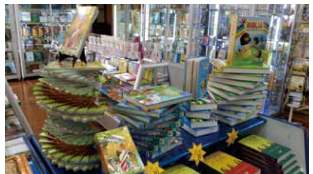
Bolivian Bible Society bookstore