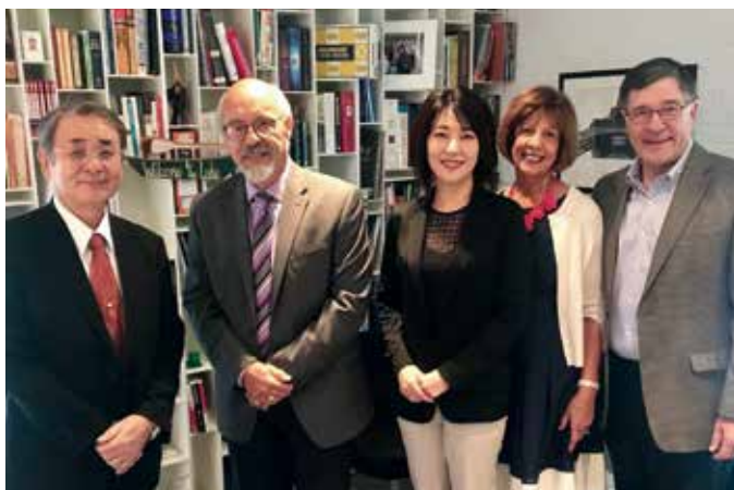
An agreement was signed with Christianity Today, US.

scint-of-Christ to people and hope to cast light on this era of uncertainty. Taking advantage of the worldwide platform, we would like to deliver the good news, good messages rapidly at low cost to not only Christians but also to non-Christians.