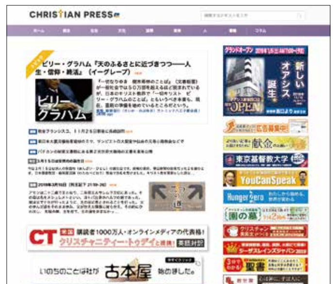
News site launched by JBS Christian Press