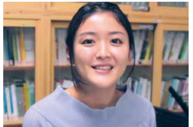
Best Award: "I've asked Christians"

V ideo Clip Competition Award is a project which invites participants to submit original video films based on Biblical words or contents. In this competition, we received 48 entries from April to July 2018. Four judges evaluated each film and selected 20 films as prize winners. This award offered two categories; 1) 1-minute video clip for CM category and 2) 3-minute video clip for short film category. Awarding ceremony was held at United Cinemas Toyosu, Tokyo.